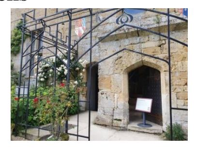
Sloped entrance to exhibitions