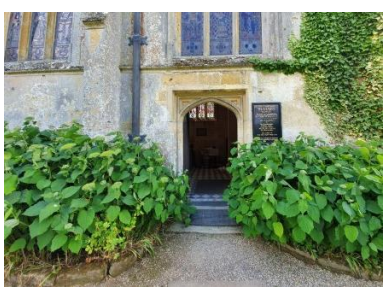
Ramped access into Church