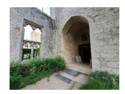
Ramped access to South Hall – entrance lobby to castle rooms

Exhibitions are over 3-floors within the castle with no lift access. There are two exhibition rooms and a Welcome Film by the family that is on ground level. Chairs are located throughout the exhibitions for visitors.