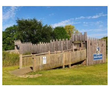
Bridge access to Adventure Playground