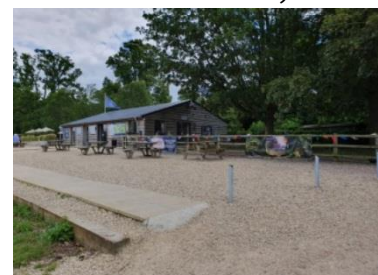
Sloped access from car park to Visitor Centre

Main Entrance, Ticketing Area and Gift Shop