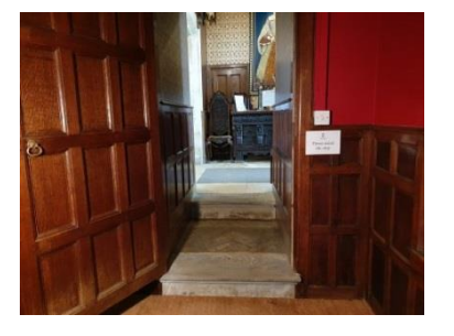
Stepped access to South Hall via Knot Corridor

Some of the family's private rooms are now open to visitors including the Library, Morning Room and Chandos Bedroom. Access to the ground floor rooms is by 3 steps with no hand-rail and the 1st floor is up a large, wooden staircase with bannister, and has no lift access.