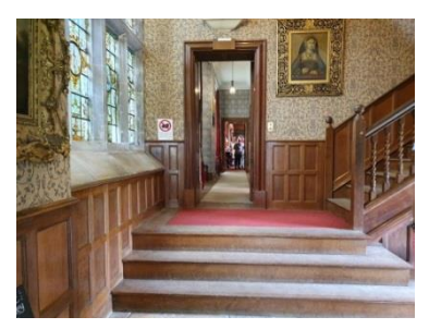
Steps to ground floor rooms in South Hall