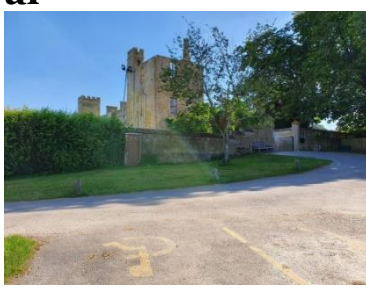
Disabled Car Park