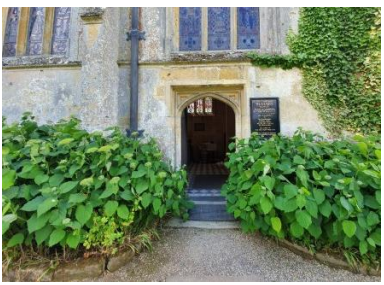
Ramped access into Church