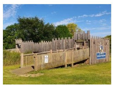
Bridge access to Adventure Playground