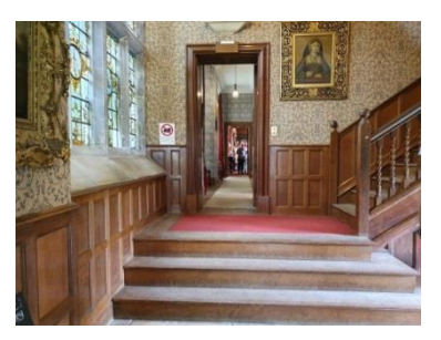
Steps to ground floor rooms in South Hall