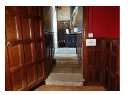
Stepped access to South Hall via Knot Corridor

Some of the family's private rooms are now open to visitors including the Library, Morning Room and Chandos Bedroom. Access to the ground floor rooms is by 3 steps with no hand-rail and the 1st floor is up a large, wooden staircase with bannister, and has no lift access. These rooms are currently closed.