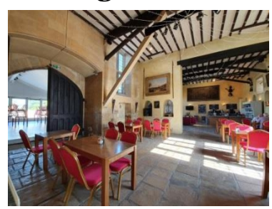
Castle Kitchen entrance