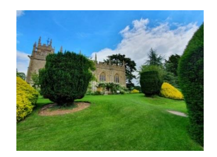
Grass bank access to Church

A number of paintings and exhibits can be seen in the entrance lobby of the castle rooms, known as 'South Hall', where a Guide or Volunteer can answer questions. There is ramped access to 'South Hall' from outside, or from the 'Knot Corridor' which links the exhibitions to the castle rooms where there are steps. These areas are currently closed.