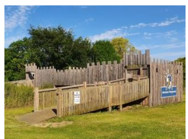
Bridge access to Adventure Playground