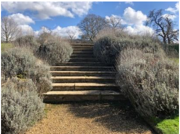
Grass bank access to Church