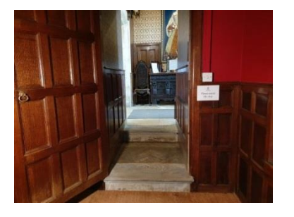
Stepped access to South Hall via Knot Corridor

Some of the family's private rooms are open to visitors including the Library, Morning Room and Chandos Bedroom. Access to the ground floor rooms is by 3 steps with no handrail and the 1st floor is up a stone, spiral staircase with a rope handrail. Alternative access and exit from the 1st floor is via a large, wooden staircase with banister. There is no lift access within the Castle Rooms. Please ask a team member from within for assistance if required.