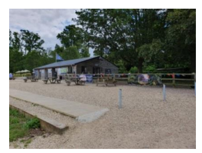
Main car park