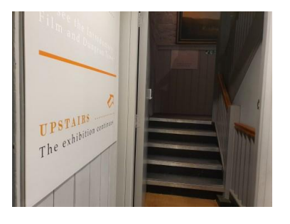
First set of stairs to exhibitions

Once at the castle there is an alternative route to avoid the steps that is signposted.