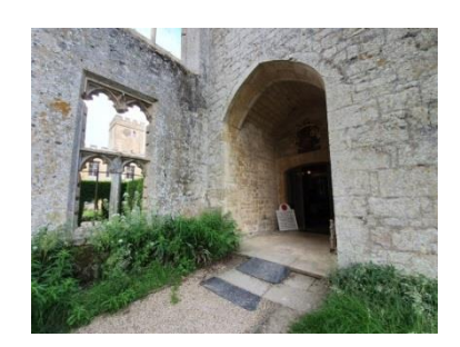
Ramped access to South Hall – entrance lobby to castle rooms

Entrance to the exhibitions is from the terrace. Exhibitions are over 3-floors within the castle with stairs with a handrail but no lift access. Chairs are located throughout the exhibitions for visitors.