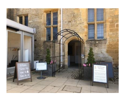
Entrance to exhibitions