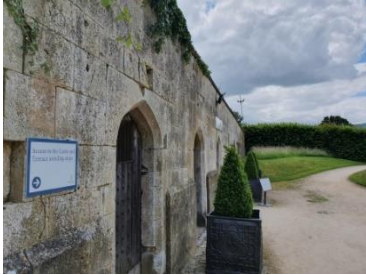
Access avoiding steps