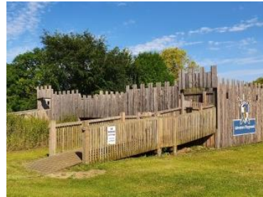
Bridge access to Adventure Playground