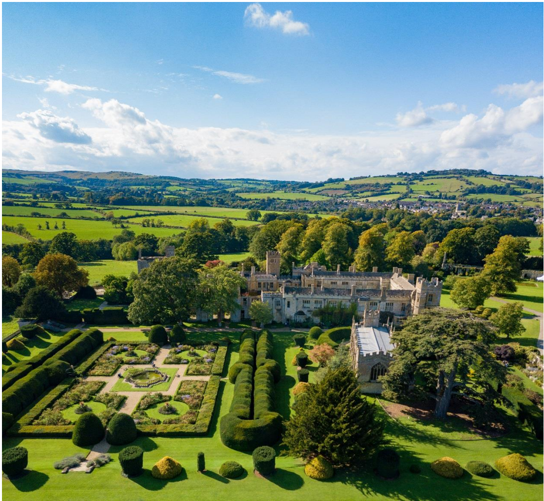
Sudeley Castle with St Mary's Church and the Queens' Garden