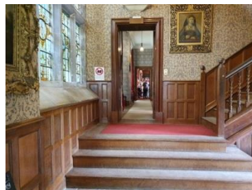
Steps to ground floor rooms in South Hall