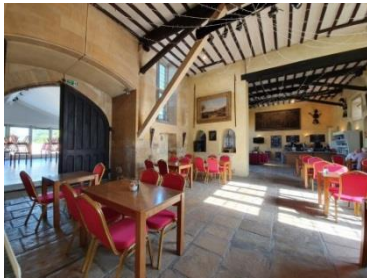
Castle Kitchen entrance