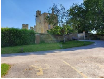
Disabled Car Park