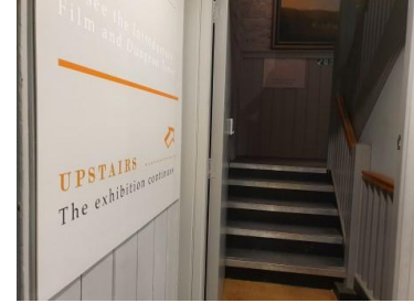
First set of stairs to exhibitions

Once at the castle there is an alternative route to avoid the steps that is signposted.