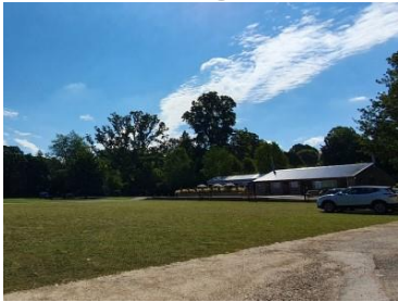
Main car park