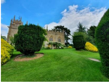
Grass bank access to Church

A number of paintings and exhibits can be seen in the entrance lobby of the castle rooms, known as 'South Hall', where a Guide or Volunteer can answer questions. There is ramped access to 'South Hall' from outside, or from the 'Knot Corridor' which links the exhibitions to the castle rooms where there are steps.