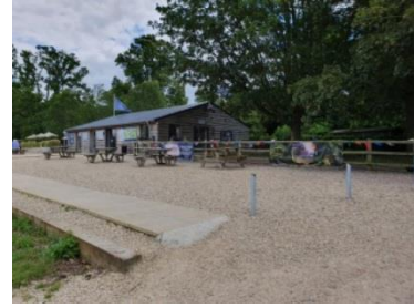
Sloped access from car park to Visitor Centre

There is ample free parking available on the site by the Visitor Centre. The car park surface is loose gravel lanes and grass verges with a large section of hardstanding spaces directly in front of the Visitor Centre.