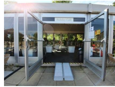
Castle Kitchen Pantry access with ramp

The Castle Kitchen restaurant is on the ground floor of the castle and sells a selection of hot and cold food and beverages and children's menu options. The Castle Kitchen restaurant and outside seating area are accessible, and the Pavilion adjacent is accessible with a ramp by request.