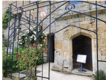
Sloped entrance to exhibitions