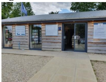
Entrance to Visitor Centre