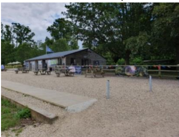
Sloped access from car park to Visitor Centre