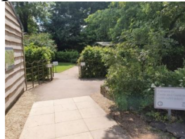
Slight slope from Visitor Centre to castle grounds

The Visitor Centre is where you pay your admission fee and is on the ground level in the car park with step free, level access, throughout.