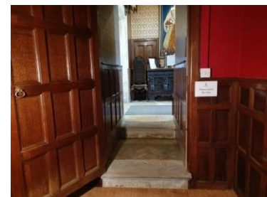
Stepped access to South Hall via Knot Corridor

Some of the family's private rooms are now open to visitors including the Library, Morning Room and Chandos Bedroom. Access to the ground floor rooms is by 3 steps with no hand-rail and the 1st floor is up a large, wooden staircase with bannister, and has no lift access.