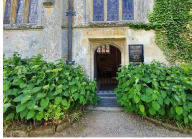
Ramped access into Church