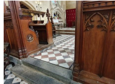
Steps to altar and Katherine Parr's tomb ( top middle )

St Mary's Church can be accessed via a grass bank to the right on the Church to avoid the steps. Katherine Parr, Henry VIII's 6th wife, is entombed within and some Sunday services take place. The Church is accessible using the side entrance on the left of the church which is a ramped entrance; however, Katherine Parr's tomb is by the altar which is only accessible by two steps without handrails.