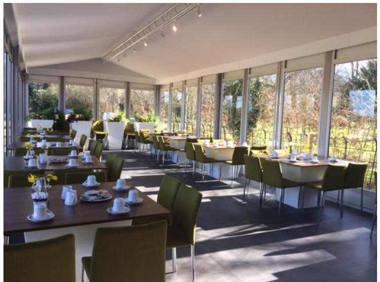
The Castle Kitchen Pantry

Both of our 'on arrival' options can be accompanied by a 'History of Sudeley' talk with one of our expert guides for an additional £5 per person. The talk lasts approximately 35 minutes and the guide will be happy to answer any questions about Sudeley and its history.