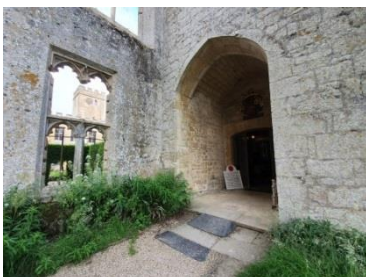
Ramped access to South Hall – entrance lobby to castle rooms

Exhibitions are over 3-floors within the castle with no lift access. There are two exhibition rooms and a Welcome Film by the family that is on ground level. Chairs are located throughout the exhibitions for visitors.