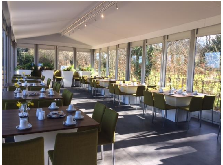
The Garden Room

Both of our ‘on arrival’ options can be accompanied by a ‘History of Sudeley’ talk with one of our expert guides for an additional £5 per person. The talk lasts approximately 35 minutes and the guide will be happy to answer any questions about Sudeley and its history.