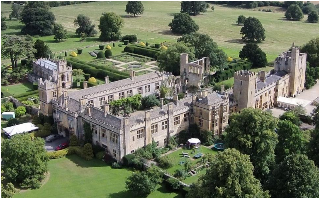
Sudeley Castle with St Mary's Church and the Queens Garden